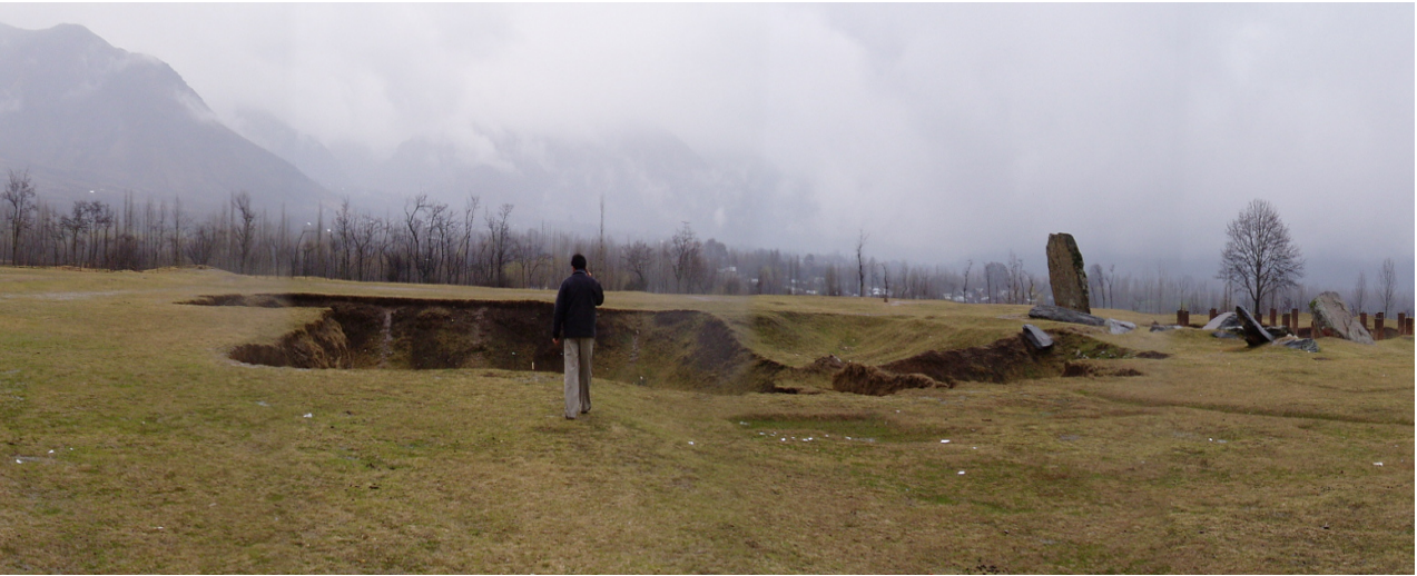
Figure 4a. Panoramic view of the Burzuhama from N-W