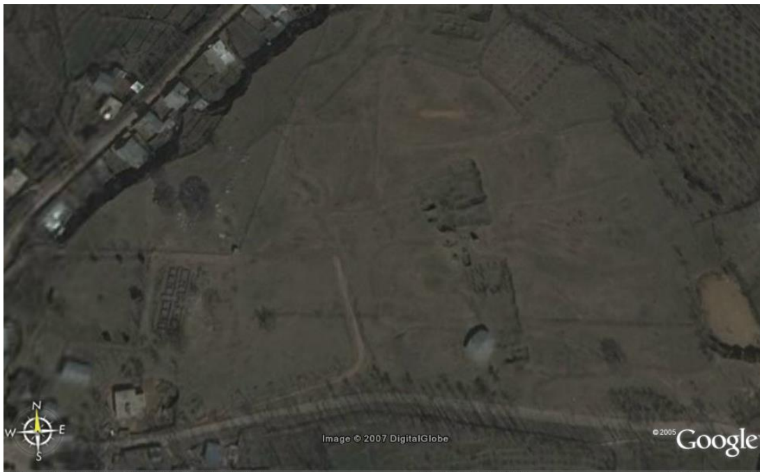
Figure 4(b). Some alignment possibilities overlaid on a satellite picture of Burzuhama