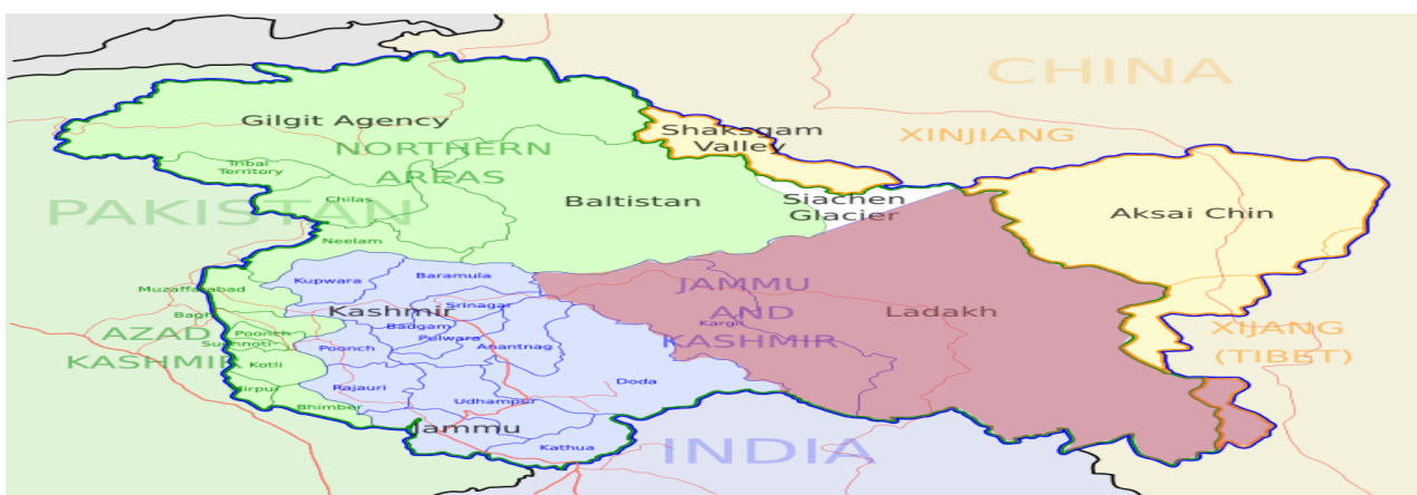
Figure 1; showing location of different sites in the map of Jammu and Kashmir (India)

It is also important to mention here that the greatest number of rock carvings at any place in the world is at Chillas proper on either side of river Indus