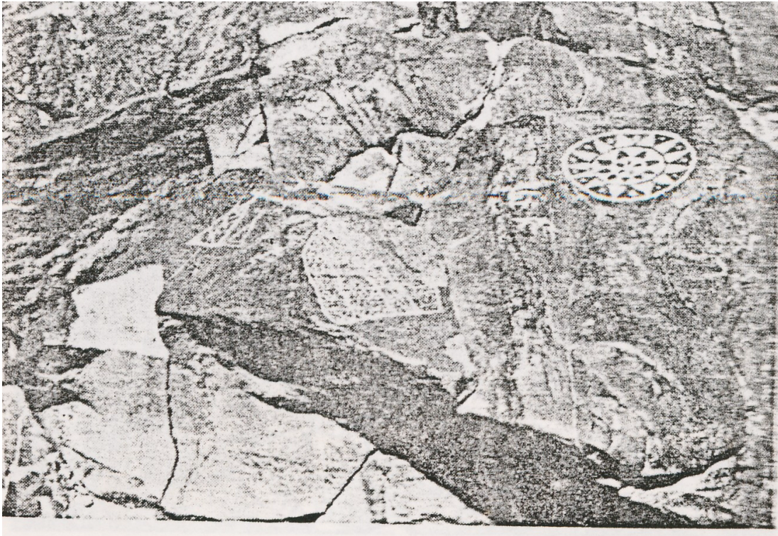
Figure 5(a); A horse rider pulling a circle showing four seasons.

5(b); Solar symbol that has in it 12 triangles possibly showing 12 months.