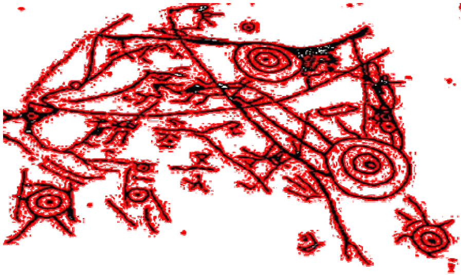
Figure 2(a); Stone carving located in Bomai Sopore of District Baramulla (Kashmir). 2(b); Drawing showing concentric circles of different sizes.