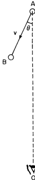
Figure 1. In the beam model schematically shown here A is the stationary component and B is the component beamed at the observer O. For apparent superluminal motion to manifest, the angle \theta has to be very small.